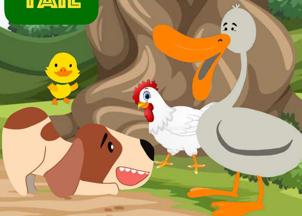
Illustration: Satyaraj Iyer